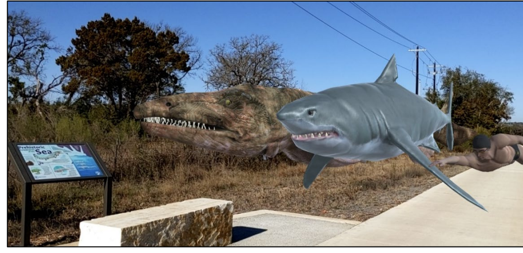
App users can trigger life-size Augmented Reality animations comparing the Mosasaur, a prehistoric sea creature, to a Great White shark and a human swimmer.