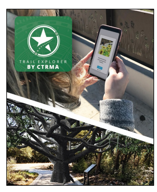
A 45SW Trail user triggers an Augmented Reality animation of a live oak tree growing on the path using the Trail Explorer by CTRMA mobile app.

By using AR to convey ideas and reinforce messaging, the likelihood that an audience will connect and invest in the information an organization is sharing increases.